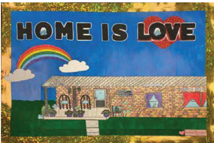
2024-25 Grand Prize Winning Poster, created by Adriana (age 11)

Must be at least 11 x 8.5 inches (letter paper) but no larger than 28 x 22 inches