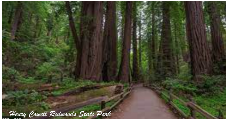
Henry Cowell Redwoods State Park